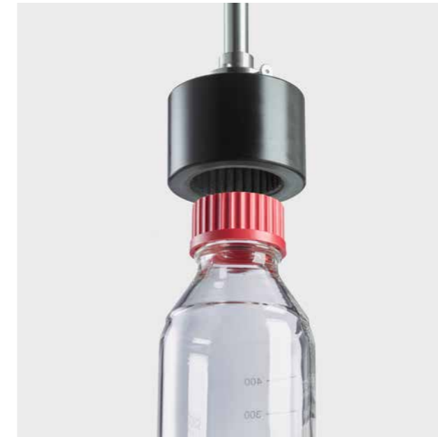
Molded cap adapter – tailored to individual cap shape

The TM200 is specifically designed to precisely measure the opening and closing torque of bottle caps. Its universal holder accommodates anything from small bottles to large jugs. A high-precision load cell located in the main unit continuously measures the force throughout the testing process.