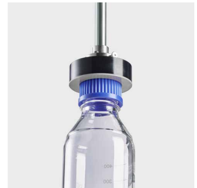
Universal membrane adapter – for caps with a flat top

Molded cap adapters that are custom-made to the specific shape of a cap eliminate additional pressure typically caused by clamping or other cap fixtures. Alternatively, universal membrane cap adapters can be utilized for caps with a flat top – minimizing the necessary number of adapters.