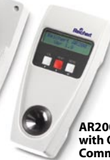
AR200/TS METER-D with Optional Communications Cradle