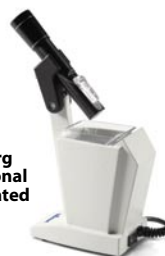
Goldberg w/Optional Illuminated Stand