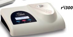
r 2 i300