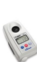
r 2 mini